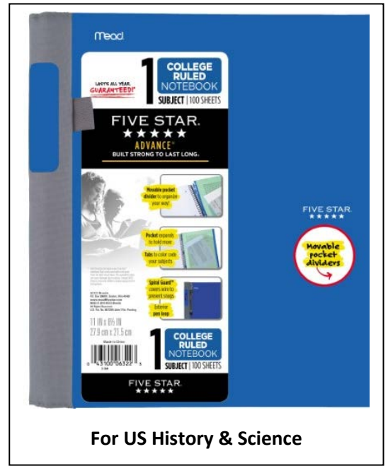
For US History & Science